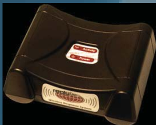
▲ Base Station